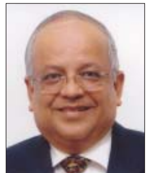
Shri V. LEELADHAR Deputy Governor Reserve Bank of India