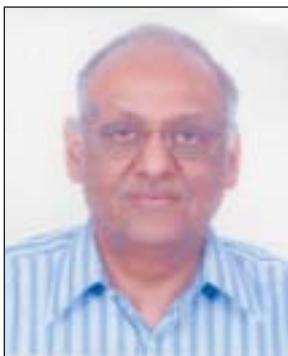
Shri ANURAG GOEL Secretary Ministry of Corporate Affairs Government of India